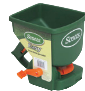
HandyGreen Handheld Spreader Setting: 3

BY SPREADER: Use the appropriate spreader setting.