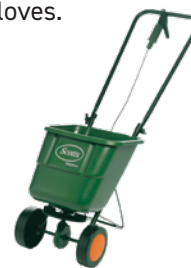
EasyGreen Rotary Spreader Setting: 23

IMPORTANT: This product, when wet, will cause iron stains. Sweep granules off paths, paving, driveways, shoes etc before contact with water. • Do not use on a new lawn less than 8 weeks old. Use Lawn Builder™ Starter instead. • Fertiliser application should be avoided if temperature is expected to exceed 30°C. • Scotts™ Lawn Builder™ is not recommended for use on other plants. • *Okay for humans, dogs and cats to re-enter lawn after application.