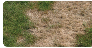
Seedling Damping Off