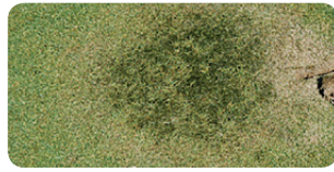
Pythium Root Rot