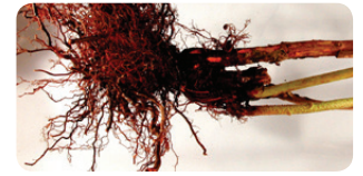
Crown and Root Rot