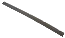
FTC140W-INSERT Replacement Squeegee Strip