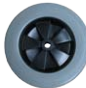
VC90LP-30 Rear Wheel