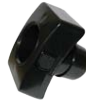
VC30L-27 Square Connector Tank