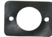
VC30L-26 Square Connector Gasket Seal