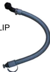
VC90LP-DUMP Dump Hose