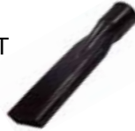
CT040 Crevice Tool