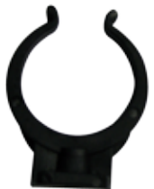
VC90LP-HOSECLIP Hose Clip