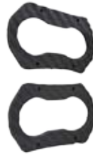
VC90LP-17 Dust Screening (2 piece)