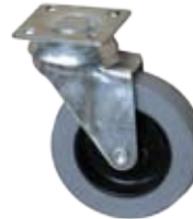
VC90LP-31 Front Castor Wheel