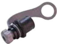
VC90LP-DUMPLUG Plug for Dump Hole