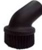
DBB040 Dusting Brush