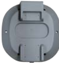
VC60L-2 Top Cover