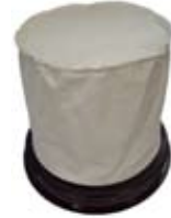
CB60 Cloth Bag