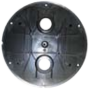
VC60L-19 Motor Base