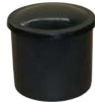
VC60L-22 Floating Ball