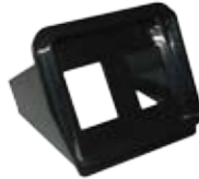
VC60L-10 Switch Stand