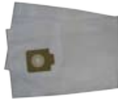
AF1086S Synthetic Dust Bag