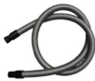
HBCOM-40 Complete Hose