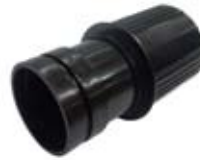
ME30/60 Machine End