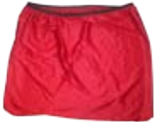
SILK-L Silk Filter Gown