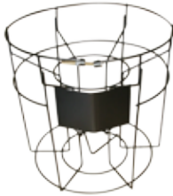
VC60L-23 Floating Rack