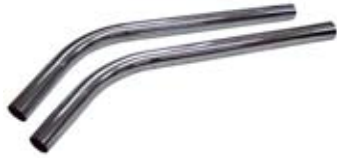
CSW040U - S Wand (Upper) CSW040L - S Wand (Lower) Sold Individually