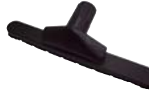
FTC140D Brush/Dry Floor Tool