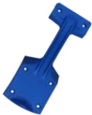
VC60L-1 Top Handle