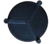
VC60L-18 3 Leg Cover