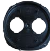
VC60L-14 Fixed Motor Cover