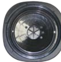
VC60L-20 Motor Base Frame