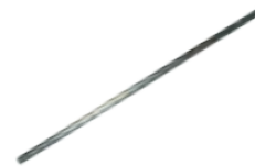
VC90LP-AXLE Back Wheel Axle